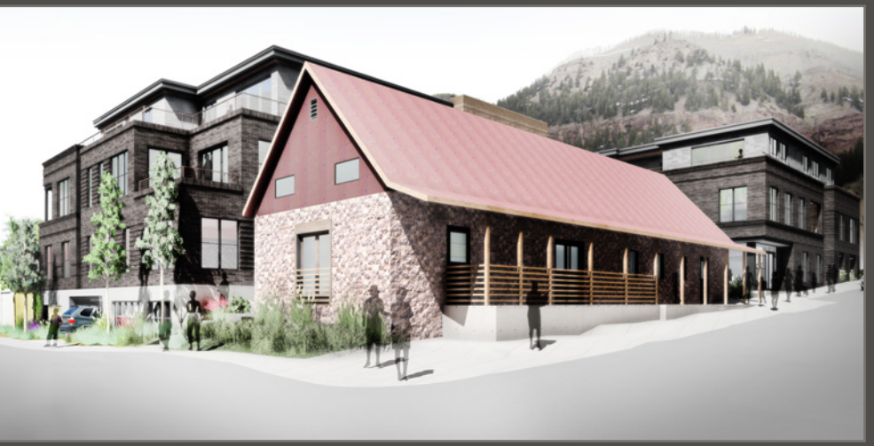
All features, dimensions, drawings, conceptual renderings, plans and specifications are subject to change without notice, and Developer expressly reserves the right to modify, revise or withdraw any or all of the same in its sole discretion. Pictures and renderings are Artist Representations and are not necessarily an accurate depiction. All improvements, design and construction, are subject to first obtaining appropriate permits and approvals. All prices are subject to change without notice.